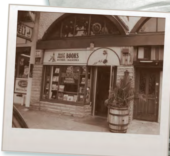
Our original storefront in Berkeley, California, which has since relocated to the Historic Kress Building in the Arts District.

In 2006, we launched the deletencensorship.org website to celebrate literature of all kinds and continue to advocate for First Amendment Rights just as our founders did.