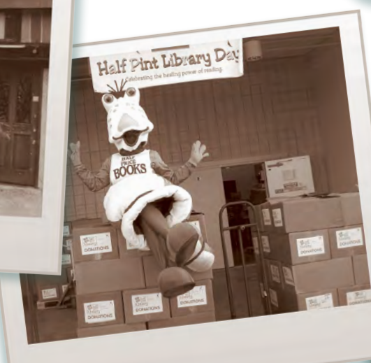
"BW" the Half Price Books Bookworm became our mascot in 1993. He's been a champion of literacy and a friend to our half-pint readers ever since.